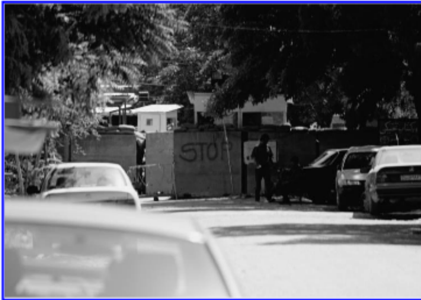
Paglen. Black Site: Kabul, Afghanistan. 2006.

But the overall question of the cultural politics of "viewing" art is something I just haven't spent that much time working out. I have a sense of what works for my own art, but don't really have a meta-theory of it. I'm much more interested in the cultural politics of producing art than the conditions of "consuming" it. I have long understood artworks as congealed social, political, and cultural relations, and that is what I'm interested in exploring. If I have anything to contribute to how we understand cultural production, it probably comes more from a "geographic" perspective than a traditional cultural-studies perspective. In a lot of my works, I try to set up various relations of seeing from which the artwork emerges. If I go out in the desert and spend a week photographing covert military operations, for example, it's quite likely that I'll ultimately end up with something quite formal or abstract looking. But the means by which I got to that particular abstraction are crucial to the work. They imply a politics of seeing and of relations of seeing and so forth. I think that there are tremendous and largely unexplored critical possibilities in this approach.