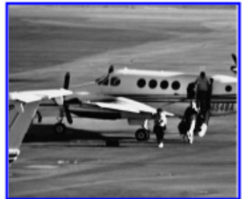
Paglen. Workers Gold Coast Terminal Las Vegas, NV Distance – 1 mile. 2007.

I take all of this as a starting point. In terms of my own aesthetic vocabulary, I tend towards images that manifest this dialectic. Images that 1) make a truth claim (“here’s X secret satellite moving through X constellation,” for example); 2) immediately and obviously contradict that truth claim (“your believing that this white streak against a starry backdrop is actually a secret satellite instead of a scratch on the film negative is a matter of belief”); 3) suggest a form of practice that could give rise to such an image (“if it’s true that this is a secret satellite, then there’s a whole lot more going on behind this image”); 4) suggest all of the above as an allegory for something about twenty-first-century images, knowledge, practice, aesthetics, and politics. Not all of the work I produce fits all of this—it’s just a loose way I use to think about what it is I’m doing.